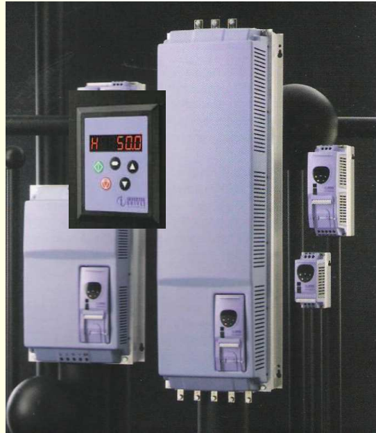
Invertex spindle drives