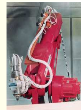
30000 rpm spindle on motoman Robot