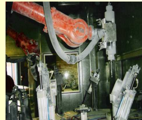
Double spindle for machining composite floor cab mouldings