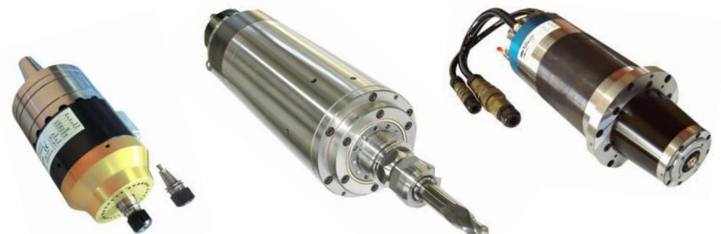
Electro spindle, air cooled 1kw –12 kw 3000 rpm - 40000 rpm. Manual tool change

High Gain Technology has supplied high speed machining systems for over 14 years. Most recently there has been a significant increase in the demand for composite and light metal cutting in the robotics industry. High Gain has been able to meet this demand with the supply of several complete machining systems. Covered in the supply are spindles, frequency converters, chillers and tooling. Several robot companies have been supplied including, ABB, Kuka, Motoman, Hyde Automation, RTS, Bauomat and Geku