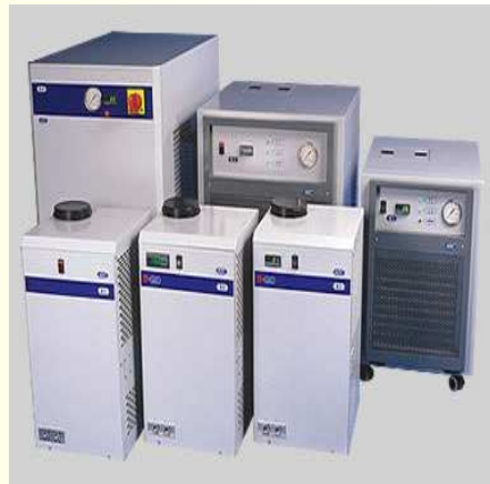
Liquid Cooling systems