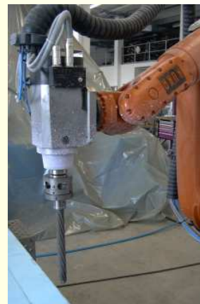
Hollow spindle and extraction for polystyrene cutting