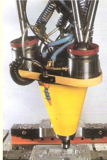
Aluminium machining with Hexapod Robot