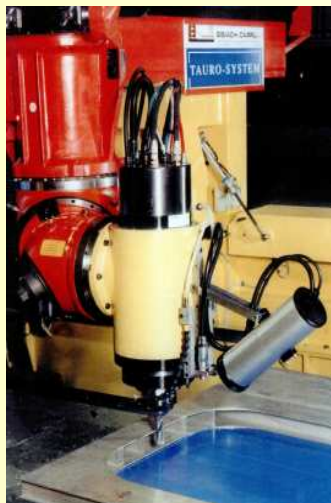
Heavy duty robot and spindle for steel cutting