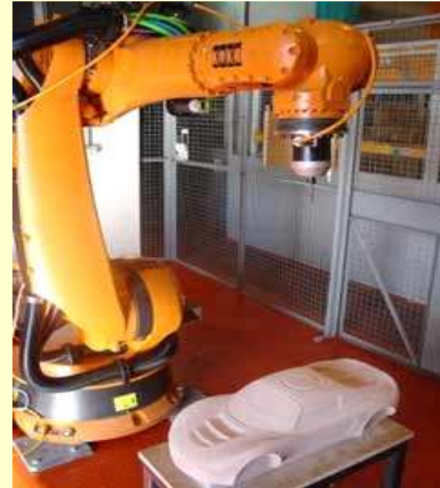
24000 rpm air cooled spindle for machining composites in a modelling studio