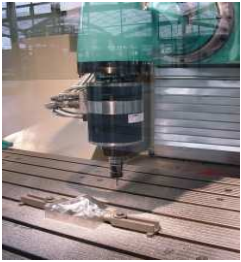
High Speed Spindles