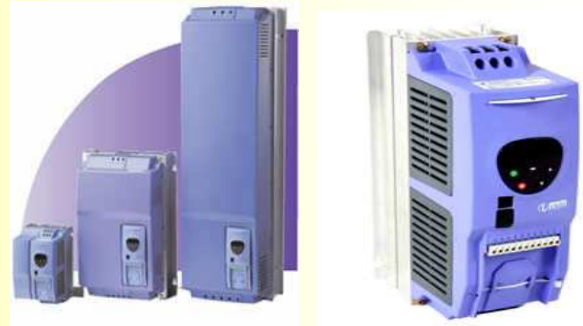
Invertek 3rd Generation Vector Control. Optidrive Plus 3 gv