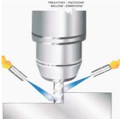
Minimal Coolant Systems