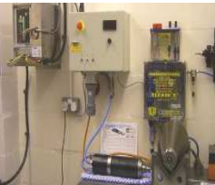
High Speed Spindle rebuild and repair