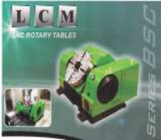
CNC Rotary Tables